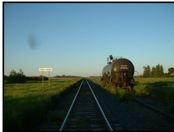
Alpine Rail Car in Lorlie, SK

Alpine has continued to grow this past year, with new customers coming on board in Saskatchewan & Alberta. Our Liquid Phosphate Fertilizer is showing itself quite well in Western Canada.