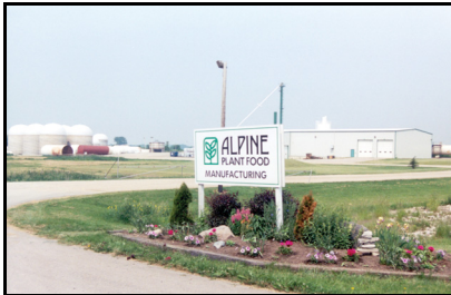
Alpine Plant Foods Corporation ... Manufacturing Plant ... New Hamburg, Ontario

Our plant in New Hamburg, ON continues to service Ontario & Western Canada with rail car shipments.